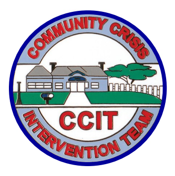
The CCIT is a community initiative for Southern New England and beyond since 2001.

A Sequential Intercept Model For Jail Diversion