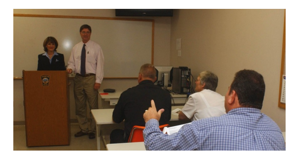
Several members of the Taunton Area CCIT have participated in local, regional, and national trainings and have developed a comprehensive classroom training program.

Participants of CCIT training will be equipped with the skills required to assist in identifying and defusing escalating situations, and will have the knowledge base and comfort level necessary to navigate the bureaucracy of institutions that often times seem counter-productive to the successful resolution of crisis situations.