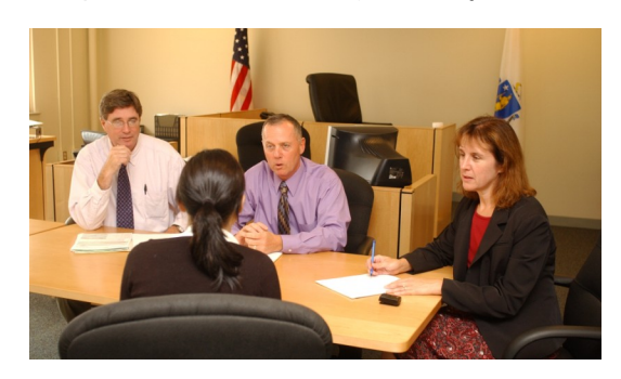
Within the context of the SIM , case conferences are a mainstay with multiple ports of referral for team

The Sequential Intercept Model (SIM) provides a conceptual framework when considering the criminalizing of mental illness. It has a primary purpose of Jail Diversion but goes beyond traditional models in a consideration of a series of points of interception where appropriate interventions can be made to prevent an individual from entering or penetrating deeper into the criminal justice system.