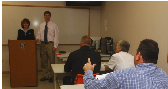
Several members of the Taunton Area CCIT have participated in local, regional, and national trainings and have developed a comprehensive classroom training program.

Participants of CCIT training will be equipped with the skills required to assist in identifying and defusing escalating situations, and will have the knowledge base and comfort level necessary to navigate the bureaucracy of institutions that often times seem counter-productive to the successful resolution of crisis situations.