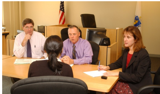
Within the context of the SIM, case conferences are a mainstay with multiple ports of referral for team

The Sequential Intercept Model (SIM) provides a conceptual framework when considering the criminalizing of mental illness. It has a primary purpose of Jail Diversion but goes beyond traditional models in a consideration of a series of points of interception where appropriate interventions can be made to prevent an individual from entering or penetrating deeper into the criminal justice system.